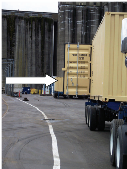
Photo shows less clearance required for a loaded container.

When parking an empty container make sure you allow for clearance of an opened container door.